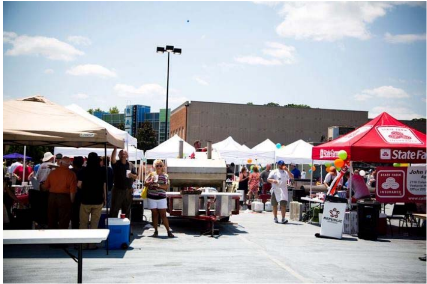
Wing Ding 2012